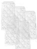
5 Side Plates